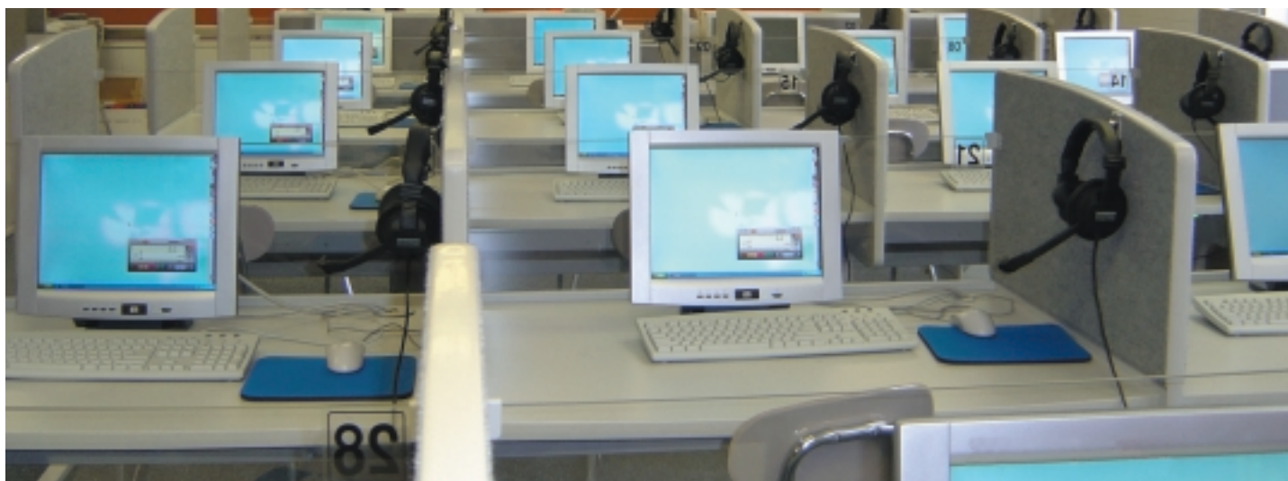
Sanako Lab 300 installation at Suffern High School